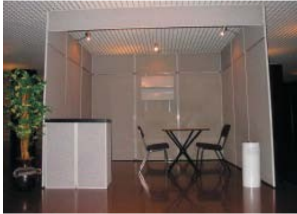
Standard 6 sqm Exhibition Shell Scheme (booth)